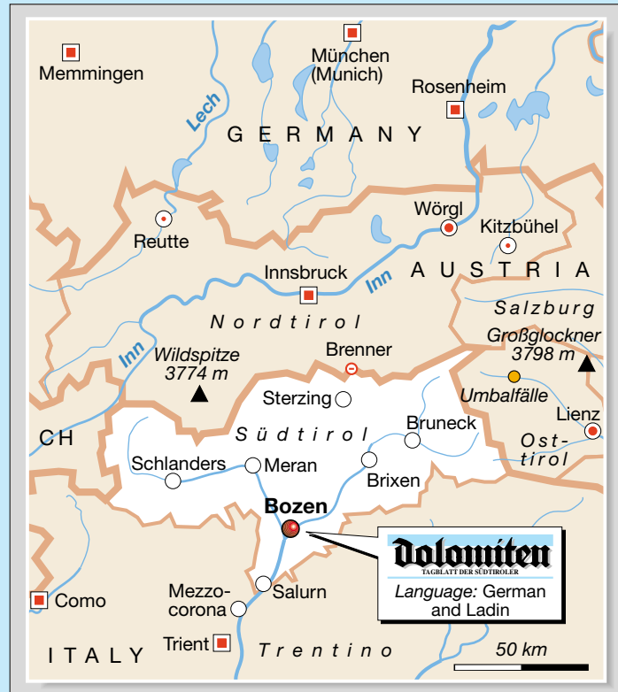
Dolomiten